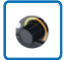
AIR REGULATOR CONTROL