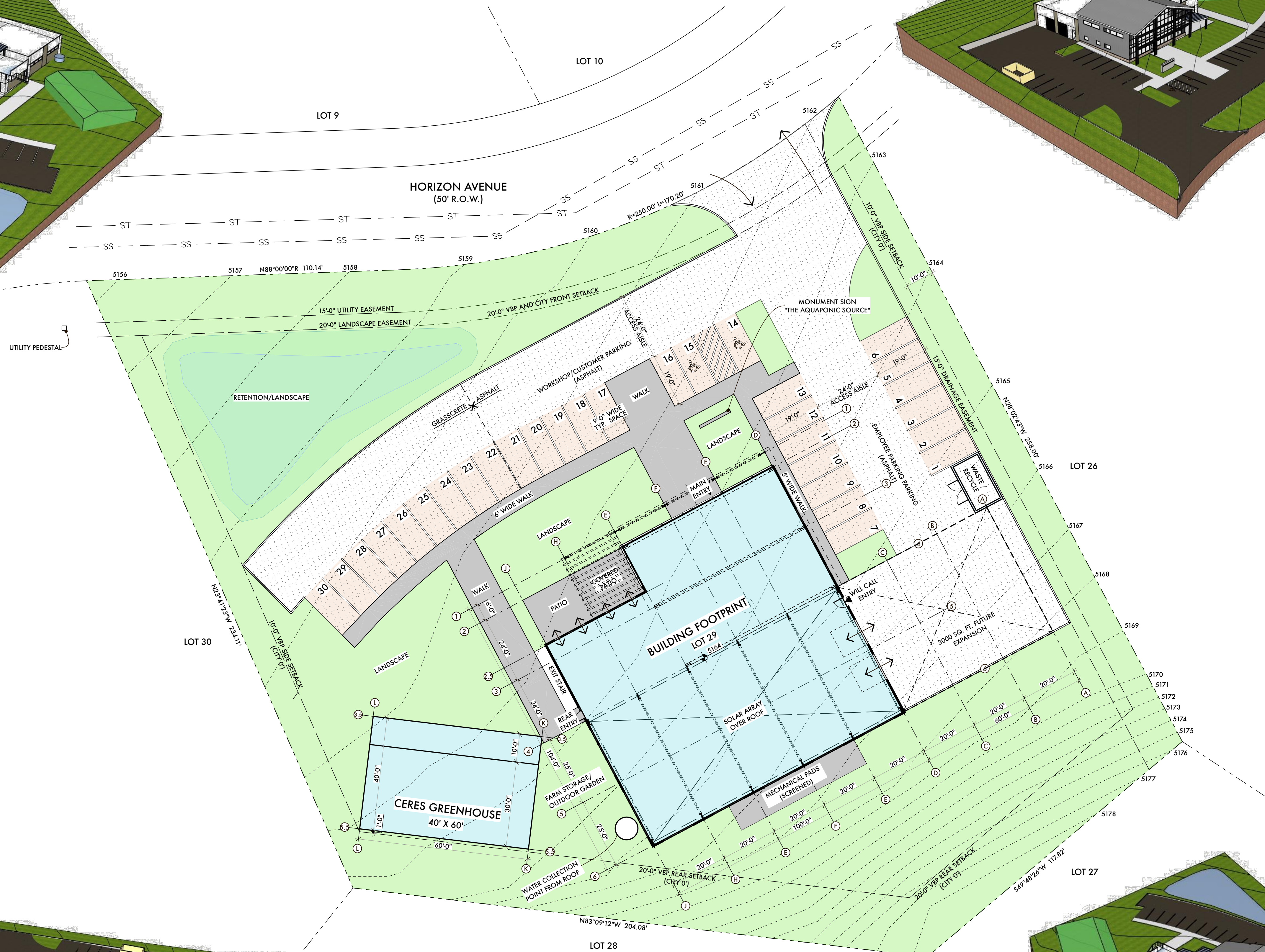
1 Architectural Site Plan SCALE: 1" = 20'